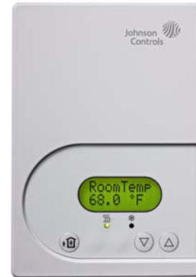
TEC26x7-4 and TEC26x7-4+PIR Series BACnet MS/TP Networked Thermostat Controller with Two Outputs